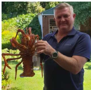
Club Liaison / New Member Officer

Manages meeting minutes, correspondence, and maintains club records.